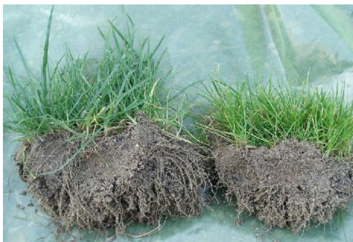
Fig. 2. Shoot and root growth of mycorrhized (left) and nonmycorrhized (right) turf grass after 8 weeks of seeding.